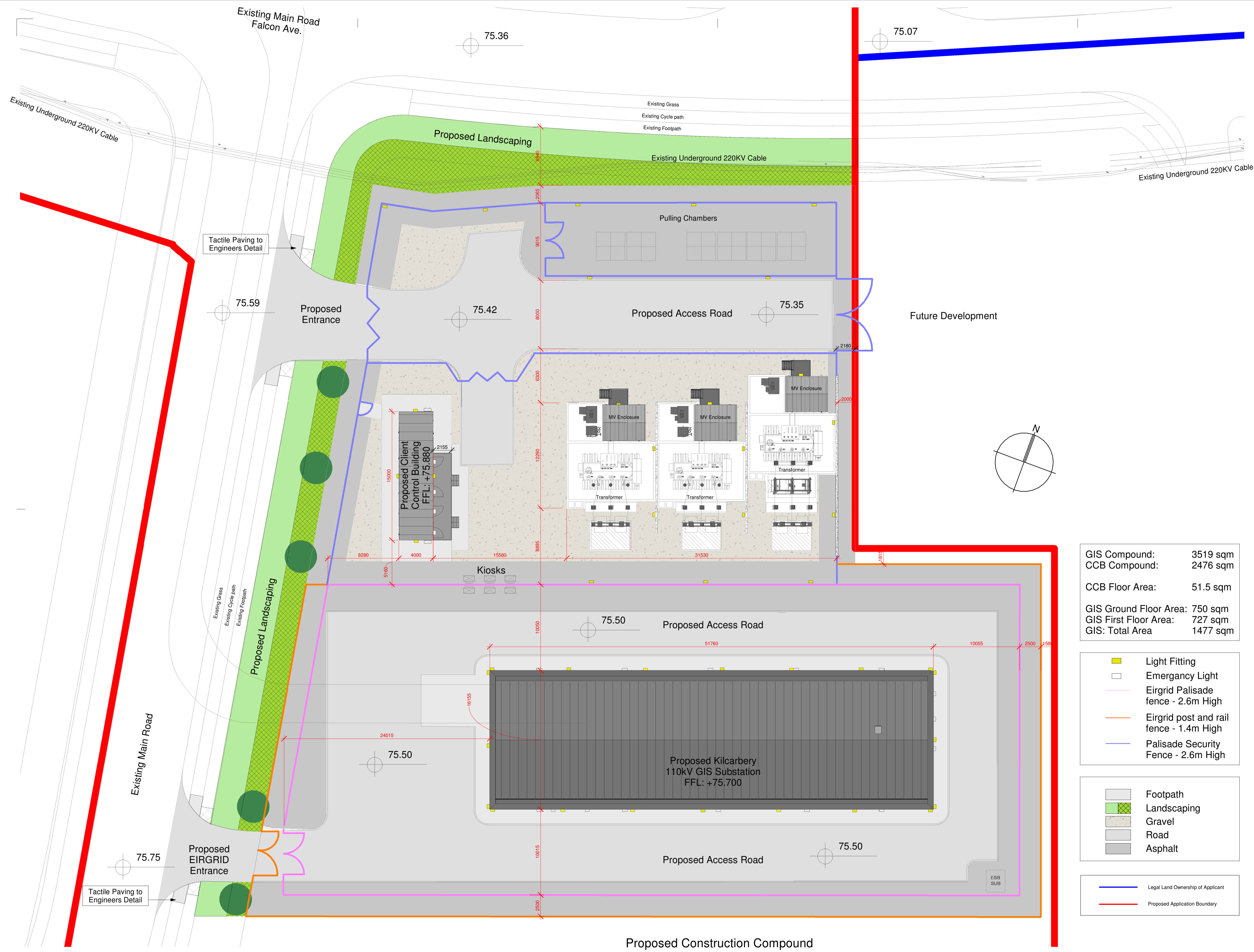
1 1003 Compund Layout Plan 1 : 200